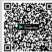
Scan for download the Application IR PLUS AGM, ANDROID system, Version 8 upwards