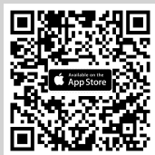
Scan for download the Application IR PLUS AGM, iOS system, Version 13.6 upwards

On the date of meeting, all shareholders are encouraged to access to the Application IR PLUS AGM, and insert Pincode for registration with attending to the meeting.