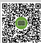
Scan for download the Manual for Using Application IR PLUS AGM (Thai language)