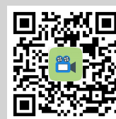
Scan for download the Instruction VDO for Using Application IR PLUS AGM