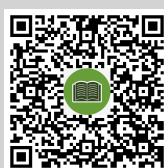
Scan for download the Manual for Using Application IR PLUS AGM (English language)